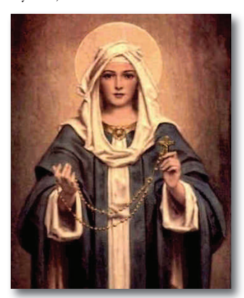
12. All those who propagate the Holy Rosary shall be aided by me in their necessities.

This promise emphasizes Our Lady's role as our Advocate and Mediatrix of all Graces. Of course, all requests are subject to God's most perfect will. God will always grant our request if it is beneficial for our soul, and Our Lady will only intercede for us when our request is good for our salvation. (See Lumen Gentium, chapter VIII – Our Lady #62.).